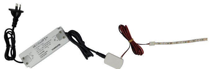
Lighting Connection Layout